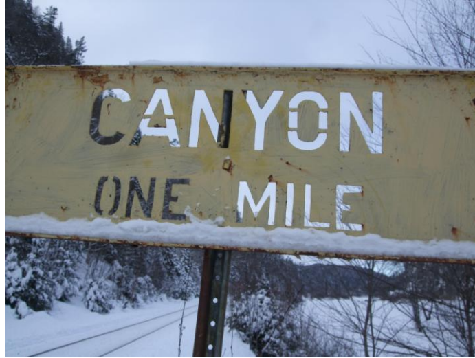
Canyon Sign at Mile 113