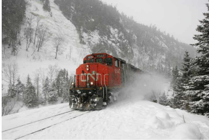
Southbound Train with the ice climb TRESTLE to the left.

The Canyon hosts over 135 ice climbs and each year between mid-December and mid-April ice formations hang off the 200 meter walls which cloak the east and west sides of the canyon.