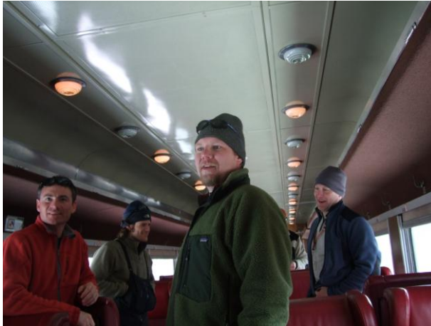
Ice climbing discussion on the Passenger Train

In the past 5 years snowmobiles have been used to access the southern section of the canyon via the power line corridor. This gives climbers access to within 20 meters of the track at Mile 110.5. From here it is a short snowshoe to several climbs including a canyon favorite "SKUKUM", Grade.3 at 70 meters which was one of the first climbs completed in 1987.