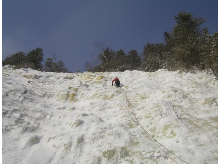
Climber leading the right side of Trestle at Mile 112

A generator supplies the power for lights and stereo, while wood that was cut in the previous fall season supplies the heat for the evening activities that take place around an open campfire. From the main staging point at Mile 112 climbers will spend Thursday afternoon through Sunday morning climbing immense waterfalls of various grades.