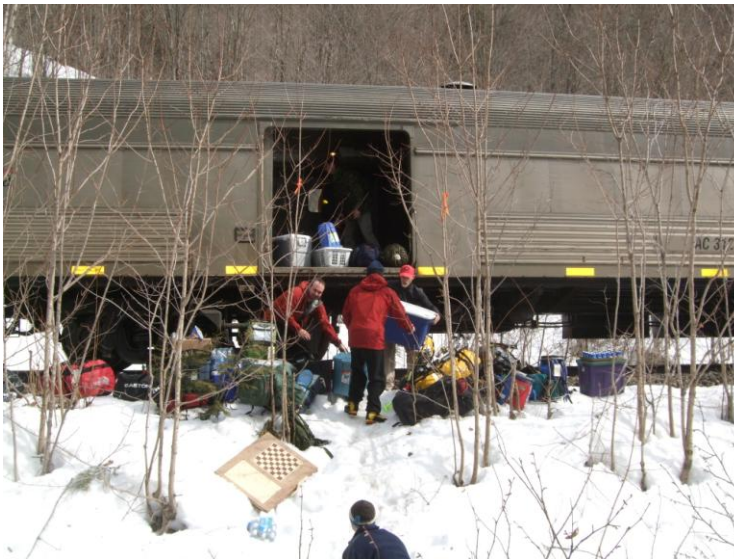
Unloading the train at the mile 112 Campsite

Once in the canyon the Conductor and train personnel know exactly where climbers disembark. Climbers exit the train from the freight car where all the gear has been stored. The North of Superior Climbing Company base camp site is located on the west side of the tracks at Mile 112.