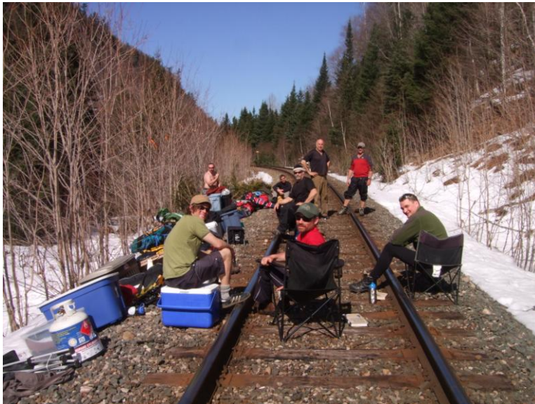
Ice Climbers waiting for the southbound train on the final day of Icefest 12.

On Sunday the 13 th at approximately 1:00 pm the southbound train stops and climbers board the train for the return to Sault Ste. Marie. A final group supper at