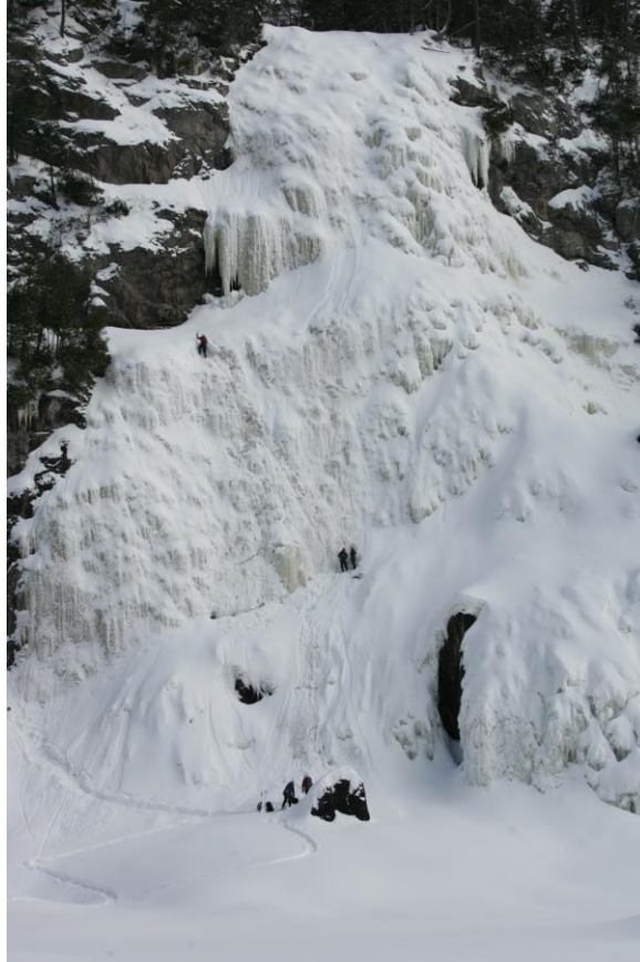
Ice Climbers on Bridalveil Falls. Photo taken from the railway tracks.

Tourist feedback to this rainbow creation gave a positive impression of the climbers with the Algoma Central Railway tour department.