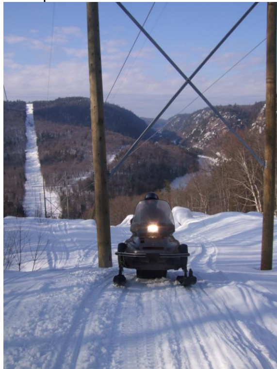
Snowmachine driving out of the canyon along the power line at Mile 110.6

In the past 5 years snowmobiles have been used to access the southern section of the canyon via the power line corridor. This gives climbers access to within 20 meters of the track at Mile 110.5. From here it is a short snowshoe to several climbs including a canyon favorite "SKUKUM", Grade.3 at 70 meters which was one of the first climbs completed in 1987.