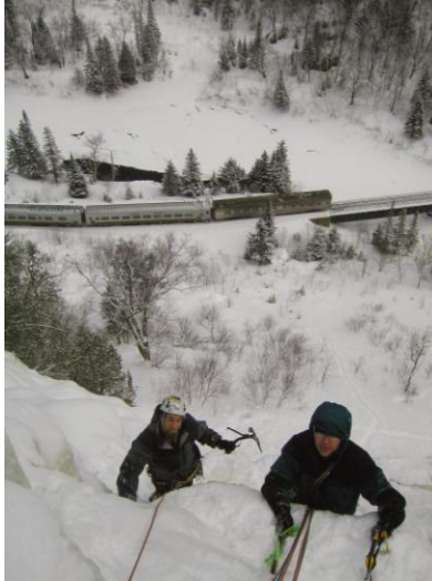
Climbers on the Trestle with Train Below

From this access site one will find the most classic climb of Agawa Canyon, named the "TRESTLE". At 100 meters, this steep slab of ice affords all styles of climbing on a 50 meter wide face of ice which varies in thickness from centimeters to meters in thickness.