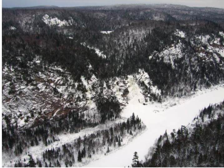
Bridalveil Falls from the air with the Agawqa River Below

can be seen scaling the frozen wall of ice called Bridalveil Falls across the Agawa River near Mile 113.